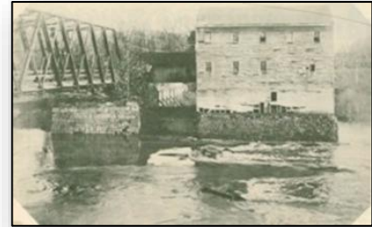
Above: Rock Dam Mill at Rt66, Carpenters Park. Below: building the first roads in Original Sherman.

For more of our history please visit us at: https://www.shermanil.org/about/village-history/ .